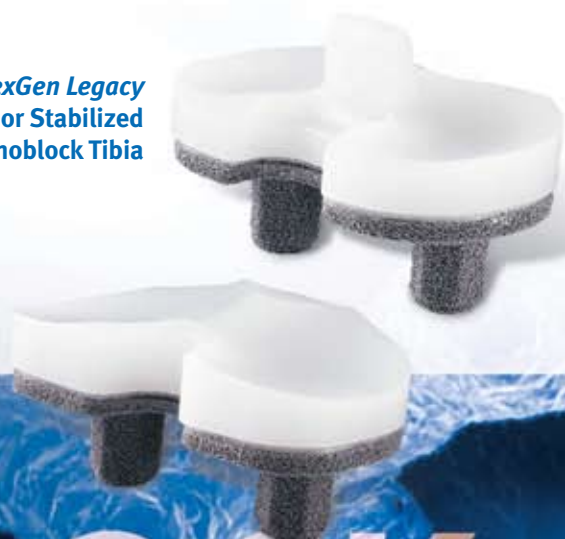
NexGen Cruciate Retaining (CR-Flex) Monoblock Tibia